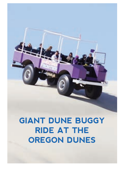
DAY 5: FRIDAY, MAY 31, 2024 Dune Buggy Adventure, Oregon's Southern Coast and Redwoods National Park

Bordering on both the Pacific Ocean and the large Yaquina Bay, Newport is so many things combined into one remarkable place. An active working waterfront, the Historical Bayfront area is home to one of Oregon's largest commercial fishing fleets. It is also an intriguing cultural district, with shops, art galleries, chowder houses, and restaurants. You'll spend the day getting to know what makes Newport such a special place to visit. Newport has not one but two lighthouses — the original lighthouse on Yaquina Bay, and a second lighthouse built in the late 1800s on Yaquina Head, north of town. At 93 feet tall, the Yaquina Head Lighthouse is the tallest active lighthouse in Oregon. You'll have time to explore the lighthouse interpretive center, do a little shopping and grab a bowl of chowder and a local beer at one of the restaurants in town. Later in the afternoon you'll board the 65' Marine Discovery vessel for a fun and fascinating sea life cruise. A marine naturalist will introduce you to the variety of sea life including gray whales, harbor porpoise, seals, sea lions, pelicans, bald eagles, and an abundance of marine birds. Dinner is on your own tonight, followed by s'mores at sunset on the patio at the Elizabeth Oceanfront Suites. (BREAKFAST AND DESSERT)