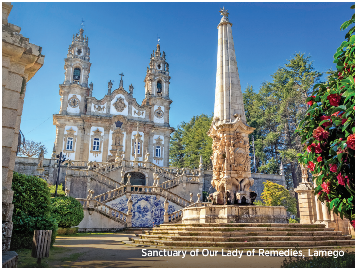
Sanctuary of Our Lady of Remedies, Lamego

secrets of its fortress and perhaps try some typical local products. Return to the ship for lunch and relax on deck as the ship sails through idyllic surroundings on the way to Régua. Meals: B, L, D