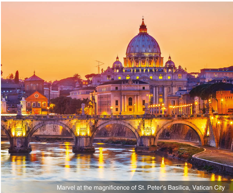
Marvel at the magnificence of St. Peter's Basilica, Vatican City

political buildings, shrines, temples and monuments, some dating back to the first kings of Rome. After a morning of historic discovery, enjoy an afternoon and evening at leisure. Meal: B