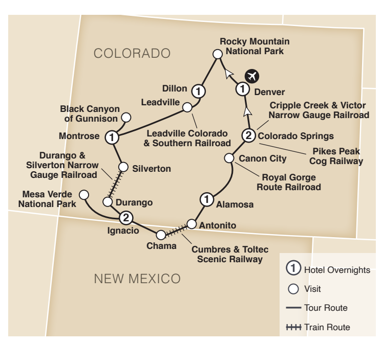
DAY 1 Arrive in Denver: Welcome to Denver, the "Mile High City." Meet your fellow travelers at 5:00 p.m. for a getacquainted dinner hosted by your Tour Manager. Meal: D

DAY 2 Rocky Mountain National Park: Departing Denver, venture into Rocky Mountain National Park, a living showcase of the grandeur of the Rocky Mountains. With elevations ranging from 8,000 feet on the wet, grassy valleys to 14,259 feet at the weather-ravaged top of Longs Peak, the park is filled with breathtaking scenery and experiences. Following the Trail Ridge Road a stop at the Alpine Visitor Center offers an opportunity to learn more about this fascinating place. Meal: B