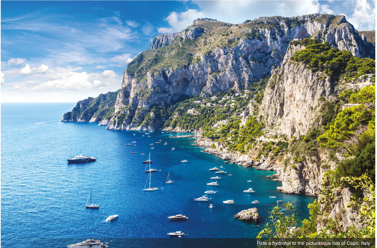
Ride a hydrofoil to the picturesque Isle of Capri, Italy