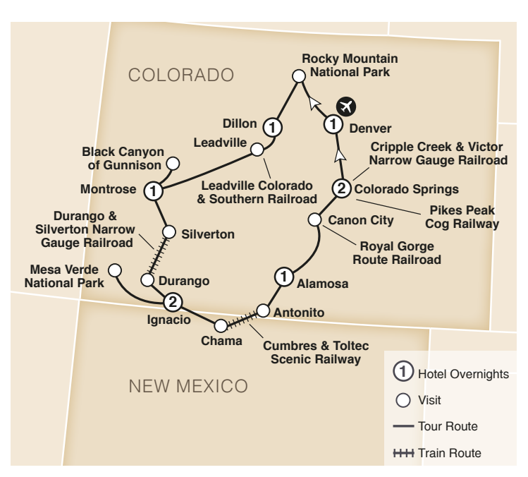
DAY 1 Arrive in Denver: Welcome to Denver, the "Mile High City." Meet your fellow travelers at 5:00 p.m. for a getacquainted dinner hosted by your Tour Manager. Meal: D

DAY 2 Rocky Mountain National Park: Departing Denver, venture into Rocky Mountain National Park, a living showcase of the grandeur of the Rocky Mountains. With elevations ranging from 8,000 feet on the wet, grassy valleys to 14,259 feet at the weather-ravaged top of Longs Peak, the park is filled with breathtaking scenery and experiences. Following the Trail Ridge Road a stop at the Alpine Visitor Center offers an opportunity to learn more about this fascinating place. Meal: B