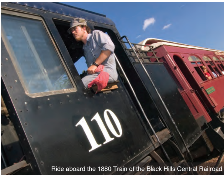
Ride aboard the 1880 Train of the Black Hills Central Railroad

DAY 5 Wall Drug Store and Badlands National Park: Begin the day at the Chapel in the Hills, a quiet retreat nestled at the foot of the Black Hills. Then stop at famed Wall Drug Store, a unique shopping emporium featuring western clothing, Indian pottery and favorite watering hole since the 1930s. Enjoy time for shopping and an on own lunch. Then, a local guide takes you through Badlands National Park, a uniquely beautiful geologic area formed over millions of years by wind, rain and erosion. Later, return to Rapid City for a farewell dinner featuring the entertainment of an Indian dancer, storyteller and flute player. Meals: B, D