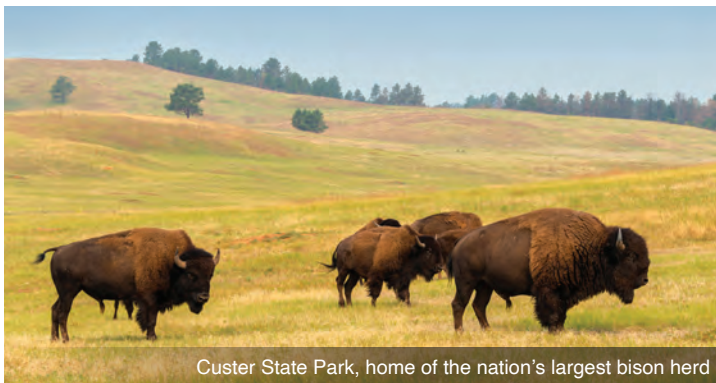
Custer State Park, home of the nation's largest bison herd

Holiday Inn Rushmore Plaza, Rapid City, South Dakota