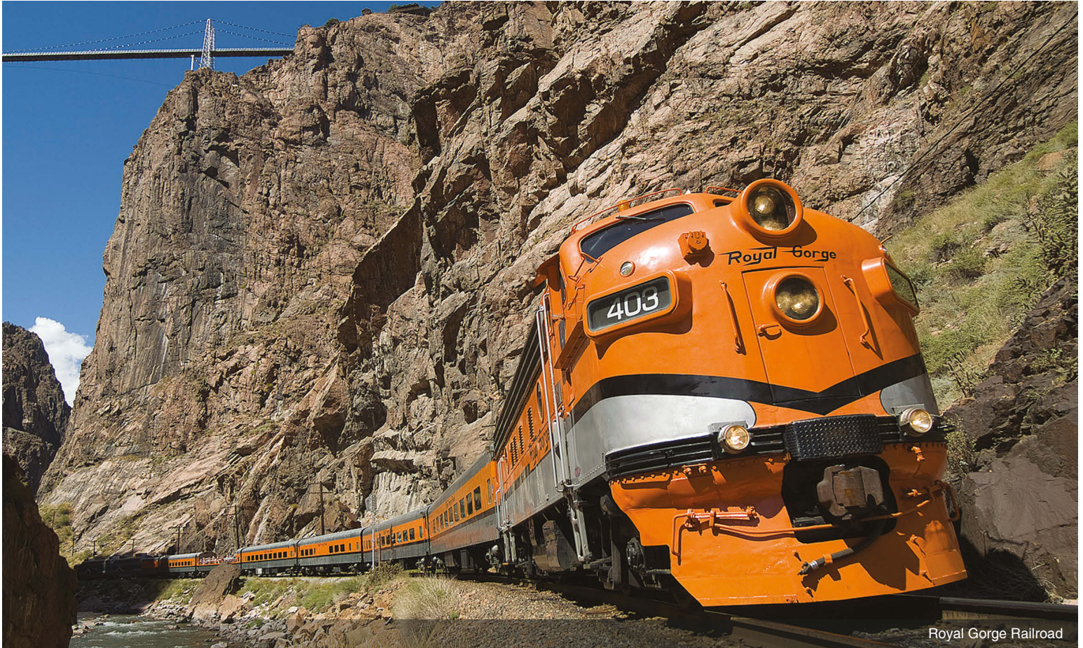
Royal Gorge Railroad